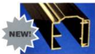
Residential Series No Exposed Screws